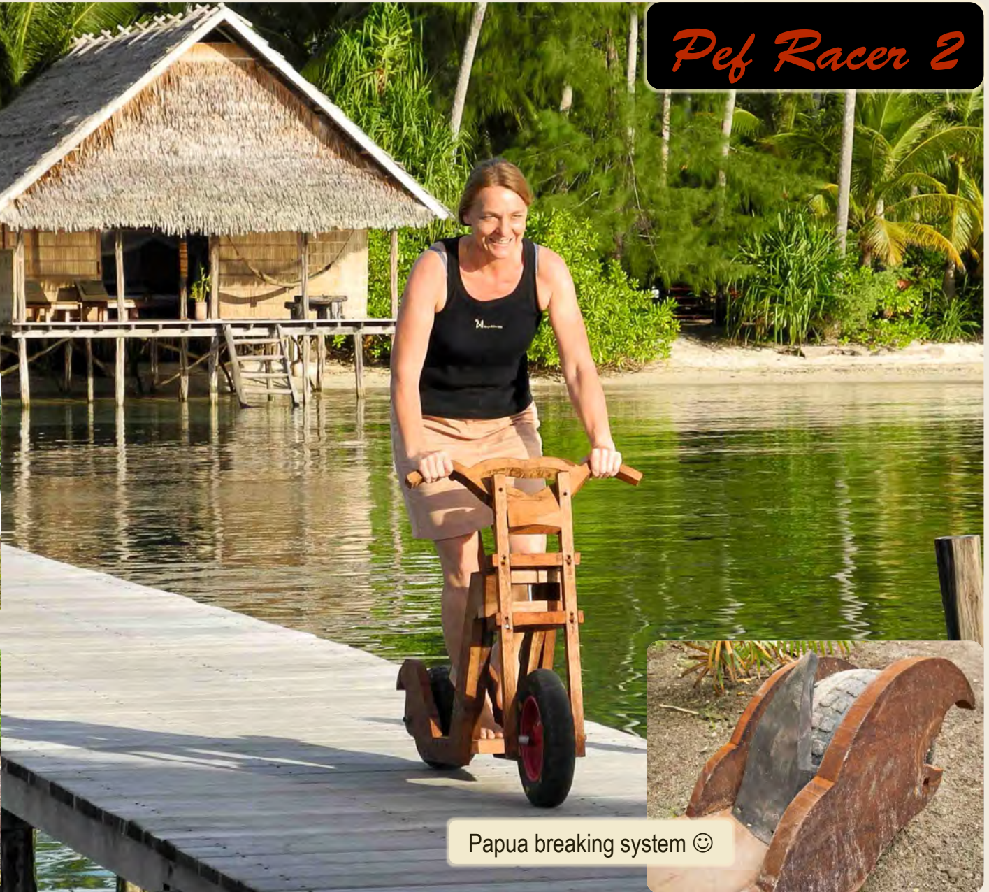
Papua breaking system ☺